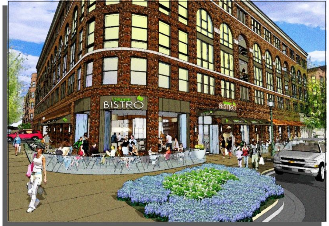
Architectural rendering—Does not reflect delivery condition

ONE CITY BLOCK - A mixed use development in the hip Uptown neighborhood. Approximately 9,800 SF of restaurant and service retail space will be available in this centrally located urban neighborhood; roughly 6,443 SF of divisible space at the SWC of 19 th & Penn and about 3,378 SF of space at the SEC of 19 th and Logan. Known for its pedestrian friendliness, historic homes, and businesses, Uptown is the gateway to the city and Downtown Denver. ONE CITY BLOCK will be comprised of 302 upscale apartment homes in four separate buildings, each one reflective in design of historic Denver, built around common courtyards and featuring luxurious modern amenities. Local award-winning developer RedPeak Properties will be seeking LEED Silver Certification in this exciting sustainable project. Retail delivery is anticipated to be 2 nd Quarter 2013. Dedicated covered parking will be available for retail and restaurant customers. In addition it is anticipated that 19 th Ave. will be converted to a two-way traffic road to increase visibility, convenience, and pedestrian activity. Be part of urban Denver's most desirable "live - work - play" neighborhood.